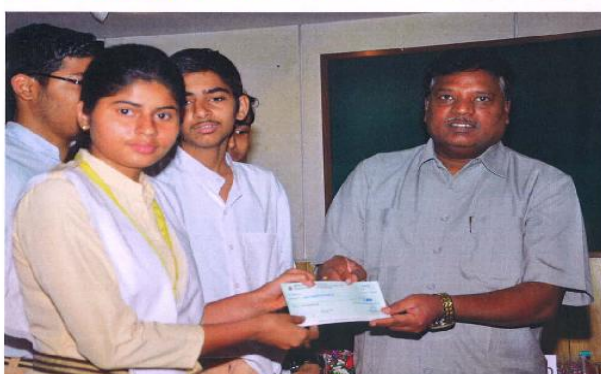
Scholarship Distribution to Students