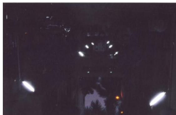
Night View of Solar street lights