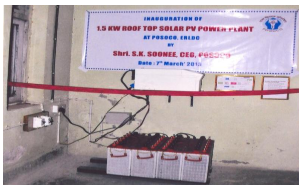
Solar PV Power Plant

Promotion of solar energy sources is an agenda of Government of India. Solar lighting system for lighting of 10 street lamp posts has been implemented in ERLDC Kolkata office of POSOCO through a state owned agency West Bengal Green Energy Development Corporation Limited.