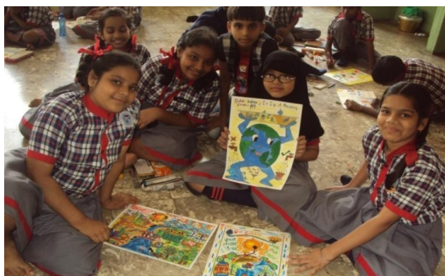
Poster Painting Competition on “Save energy

Various activities like intra-school competitions, teacher’s training programme, exposure visits to energy efficient building, inter-school competitions under the event EUPHORIA and Prize distribution ceremony were organised.