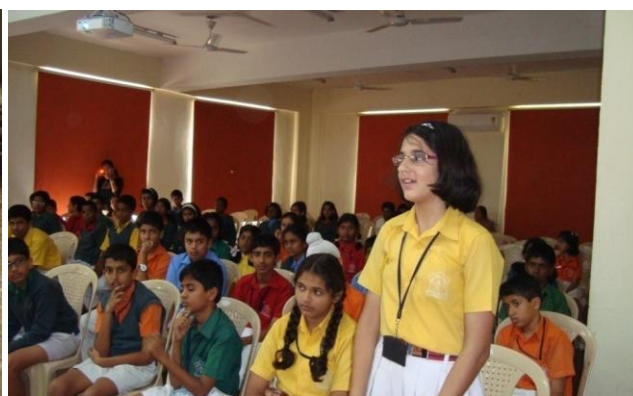
Bringing in awareness on Energy y through Quiz Competitions