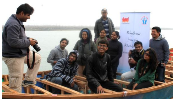
Youth Engagement through Film making workshops

This program was executed in 200 rural households around Shillong in the districts, who do not have access or have partial access to electricity. Two districts, East Khasi Hills and Jaintia Hills were identified for implementing this program.