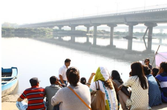
Field visits to ecologically sensitive Rivers

Programs was successful in engaging youth in understanding the importance and relevance of these old cities like Delhi and Kolkata, their various spaces and historical progression. Educating youth on appreciating the traditions and culture of their respective cities would culturally empower them and they will become active citizens having the capability to steer societies towards a culture of sustainability and co-existence.